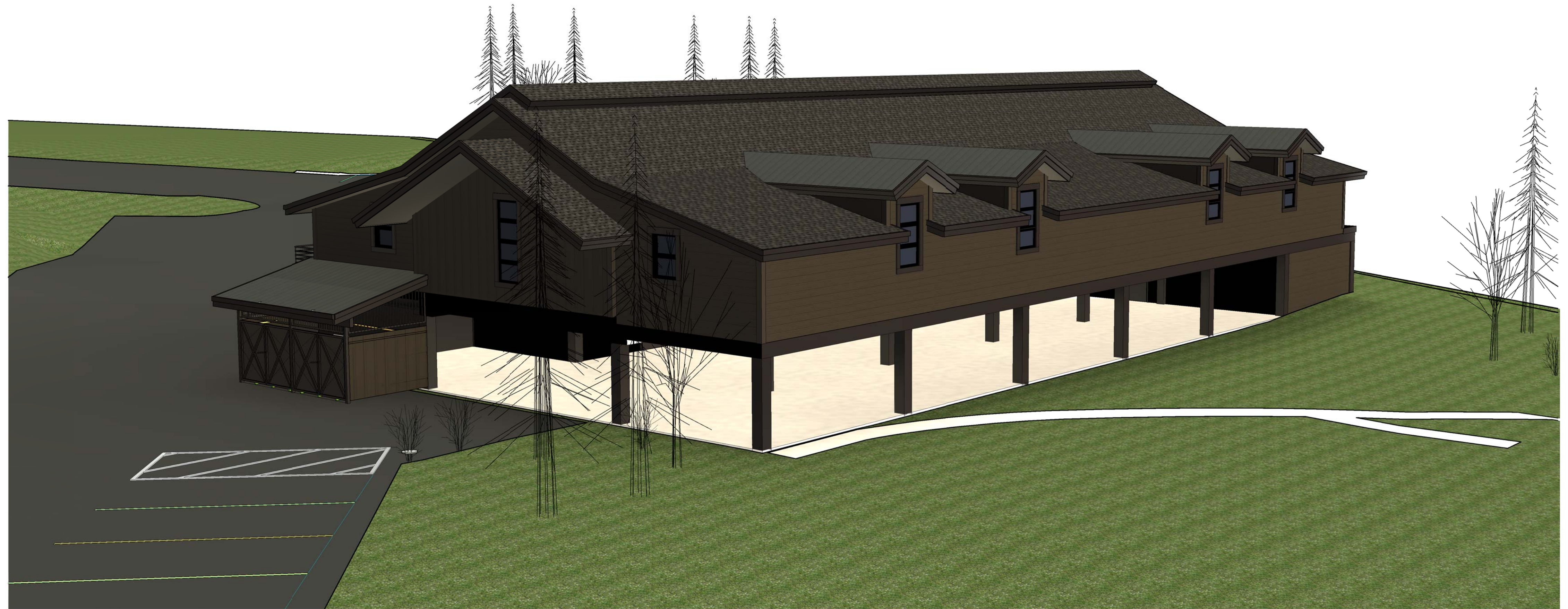
2 VIEW FROM NORTHWEST DP-18.1