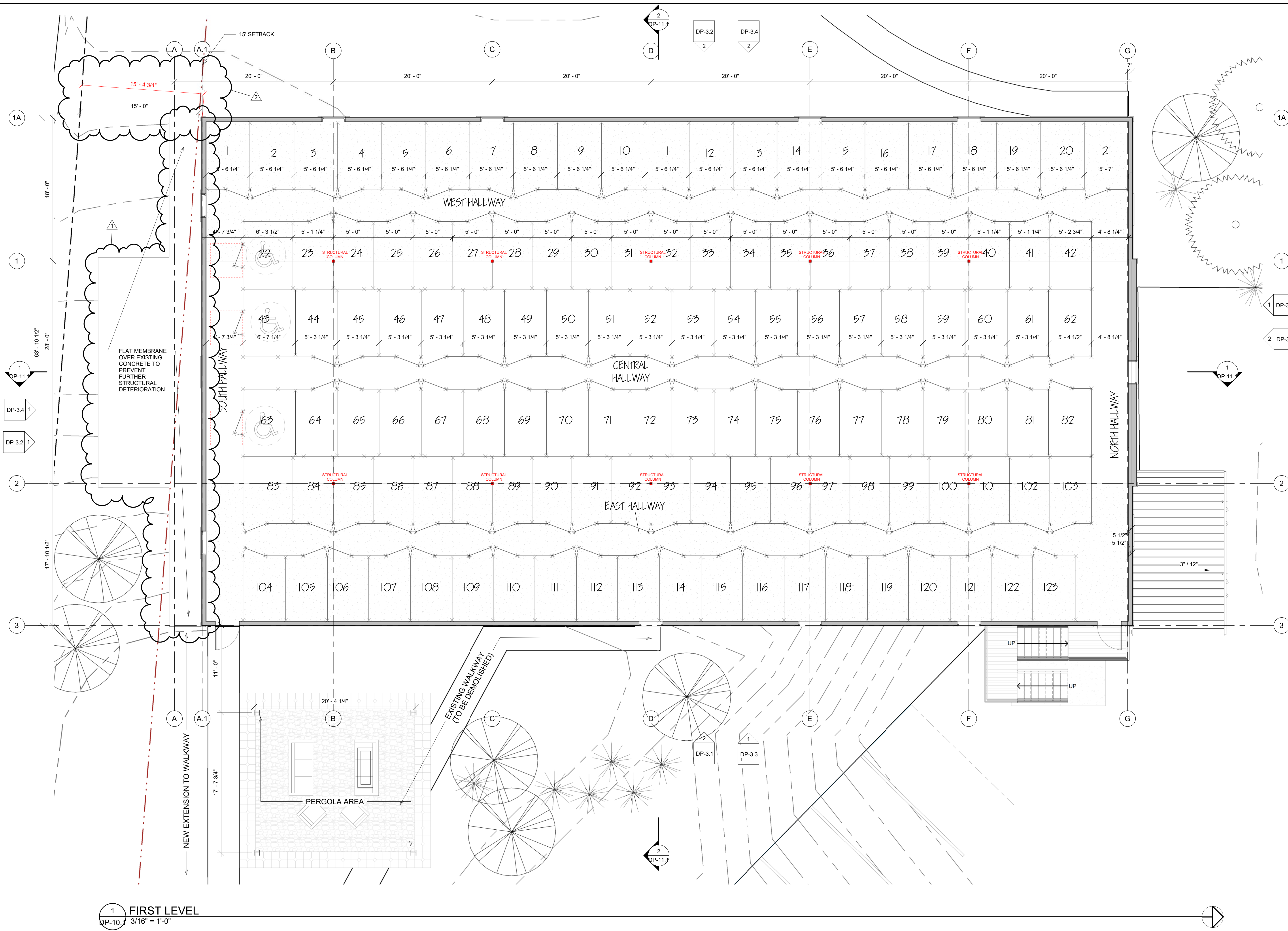
1 FIRST LEVEL DP-10.1 3/16" = 1'-0"

NOTICE DUTY OF COOPERATION Release of these plans contemplates further cooperation among the owner, his contractor and the architect. Design and construction are complex. Although the architect and his consultants have performed their services with due care and diligence, they cannot guarantee perfection. Communication is required and every contingency cannot be anticipated. Any ambiguity or discrepancy discovered by the use of these plans shall be reported immediately to the architect. Failure to notify the architect compounds misunderstanding and increases construction costs. A failure to cooperate by a single party to the architect shall relieve the architect from responsibility for the consequences. Changes made from the plans without consent of the architect are unauthorized and shall relieve the architect of responsibility for all consequences arising out of such changes. All design, documents and data prepared by Eric Smith Associates, P.C. as instruments of service shall remain property of Eric Smith Associates, P.C. and shall not be copied, changed or disclosed in any form whatsoever without first obtaining the express written consent of Eric Smith Associates, P.C. Eric Smith Associates, P.C.