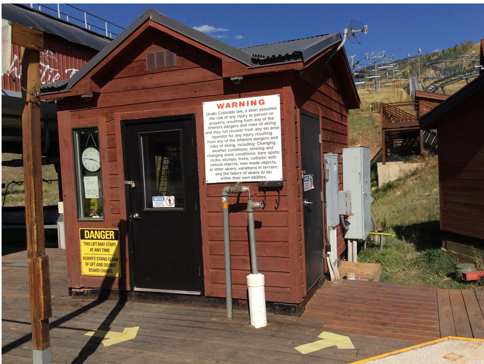
CPX LOWER TERMINAL - OPERATOR CABIN