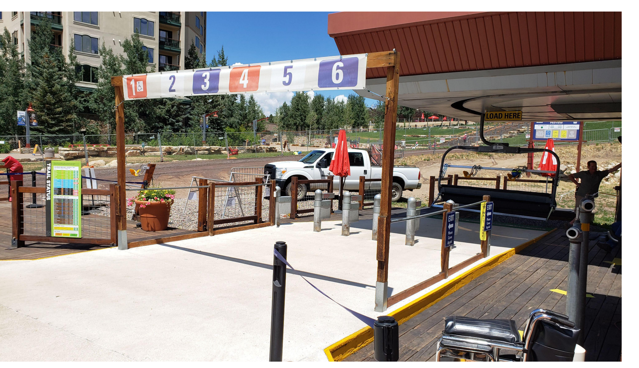
CPX LOWER TERMINAL - DECK AND RFID GATES