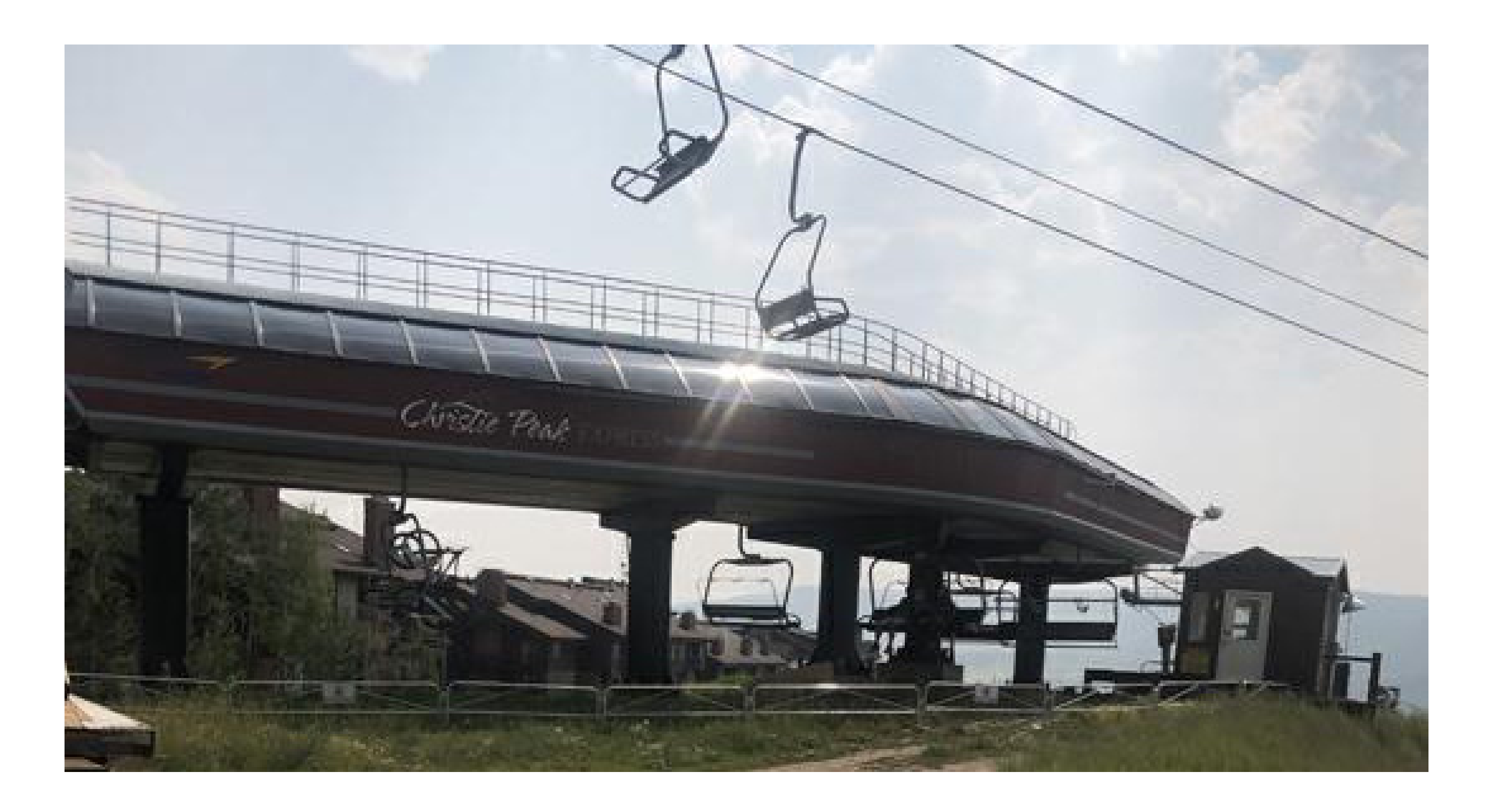
CPX MID-STATION - NORTH ELEVATION