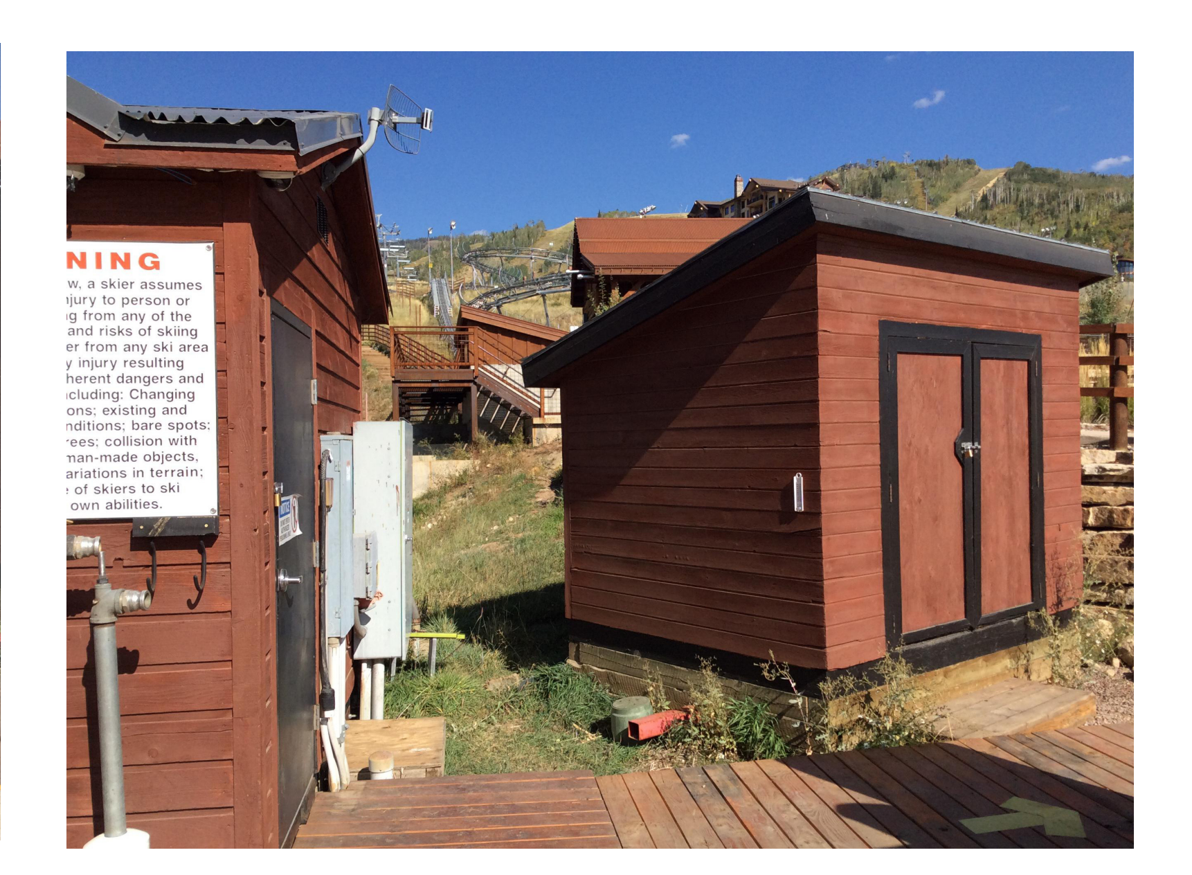
CPX LOWER TERMINAL - STORAGE SHED