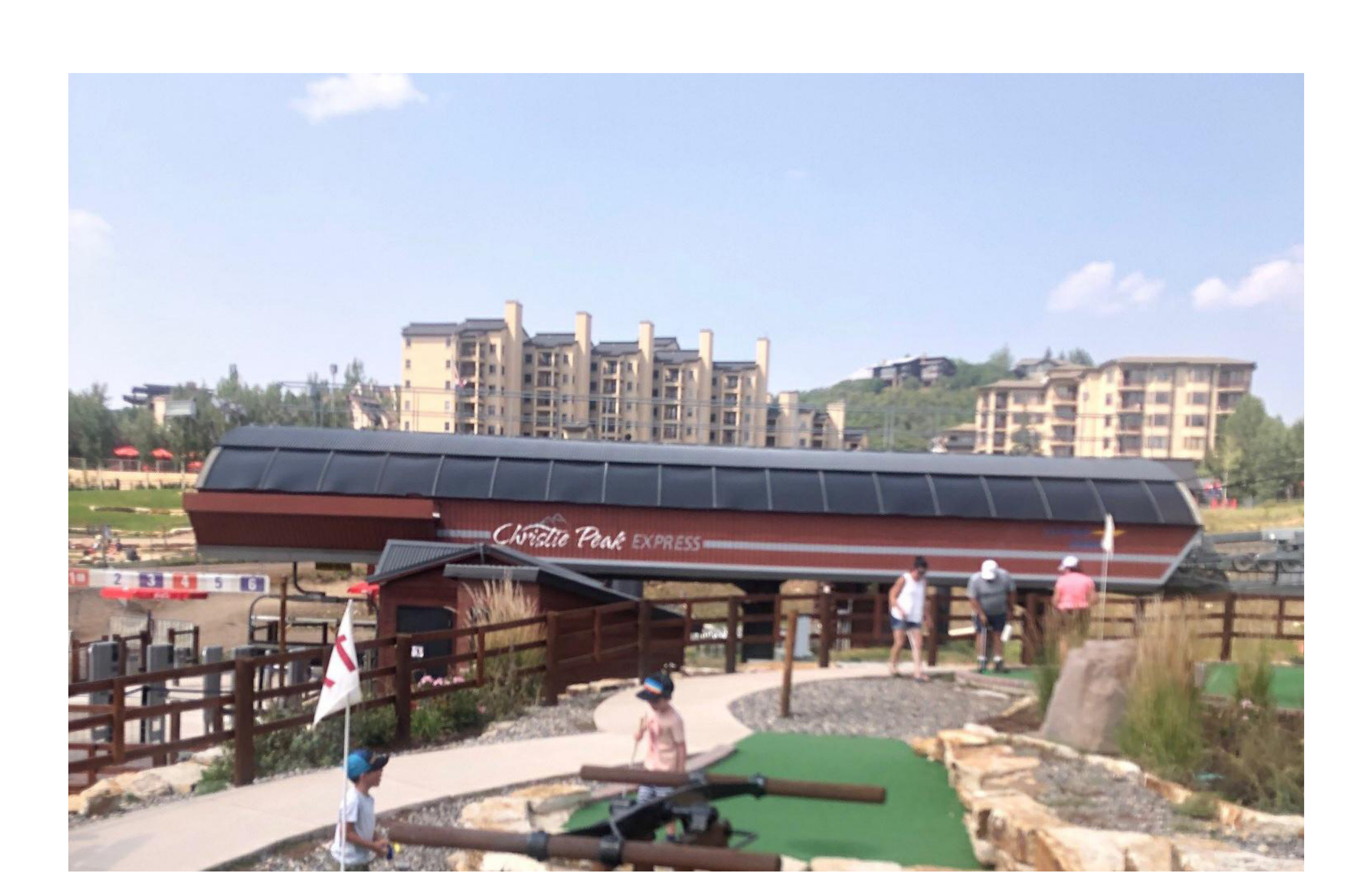
CPX LOWER TERMINAL - SOUTH ELEVATION