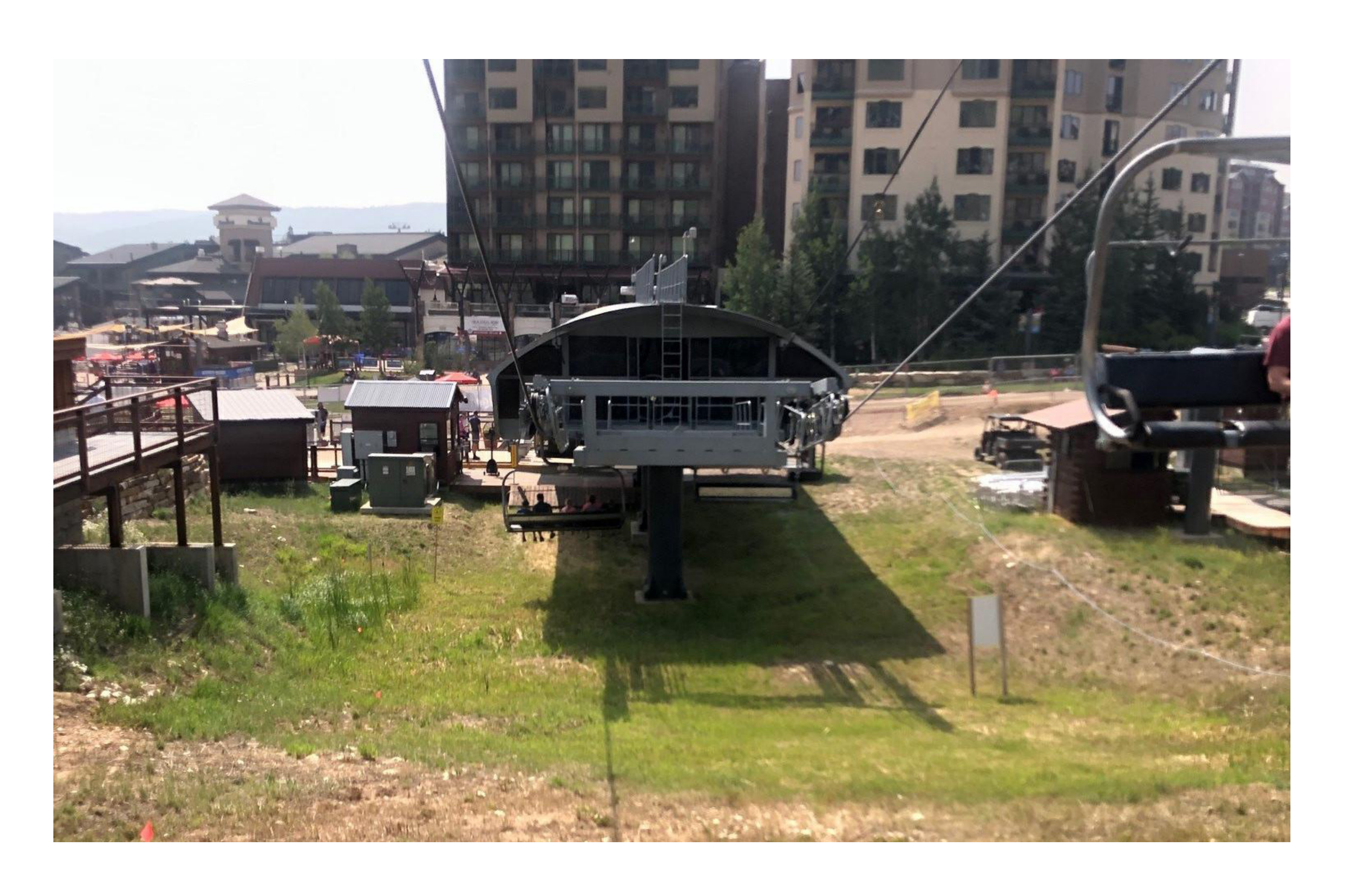
CPX LOWER TERMINAL - EAST ELEVATION