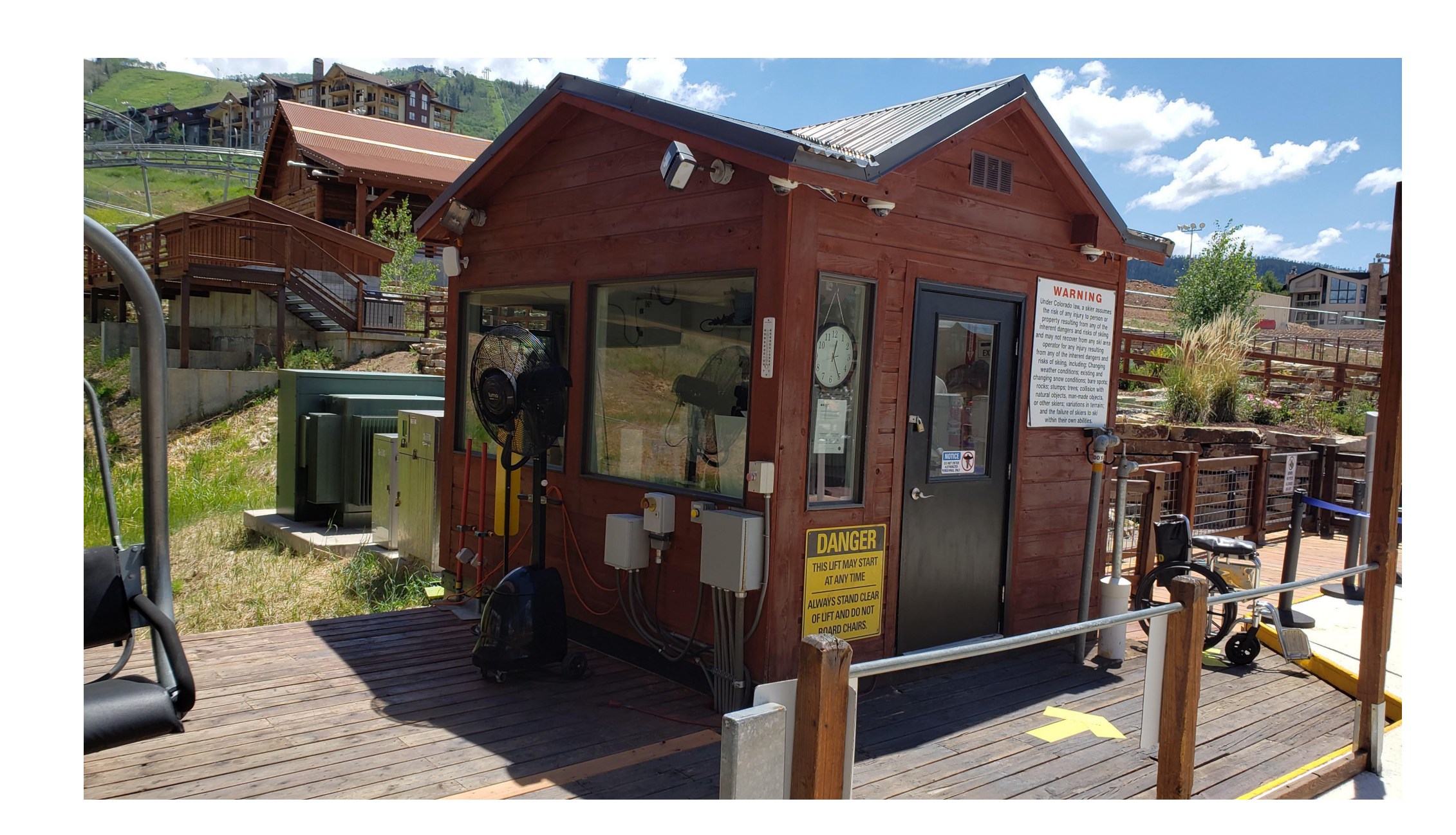
CPX LOWER TERMINAL - OPERATOR CABIN