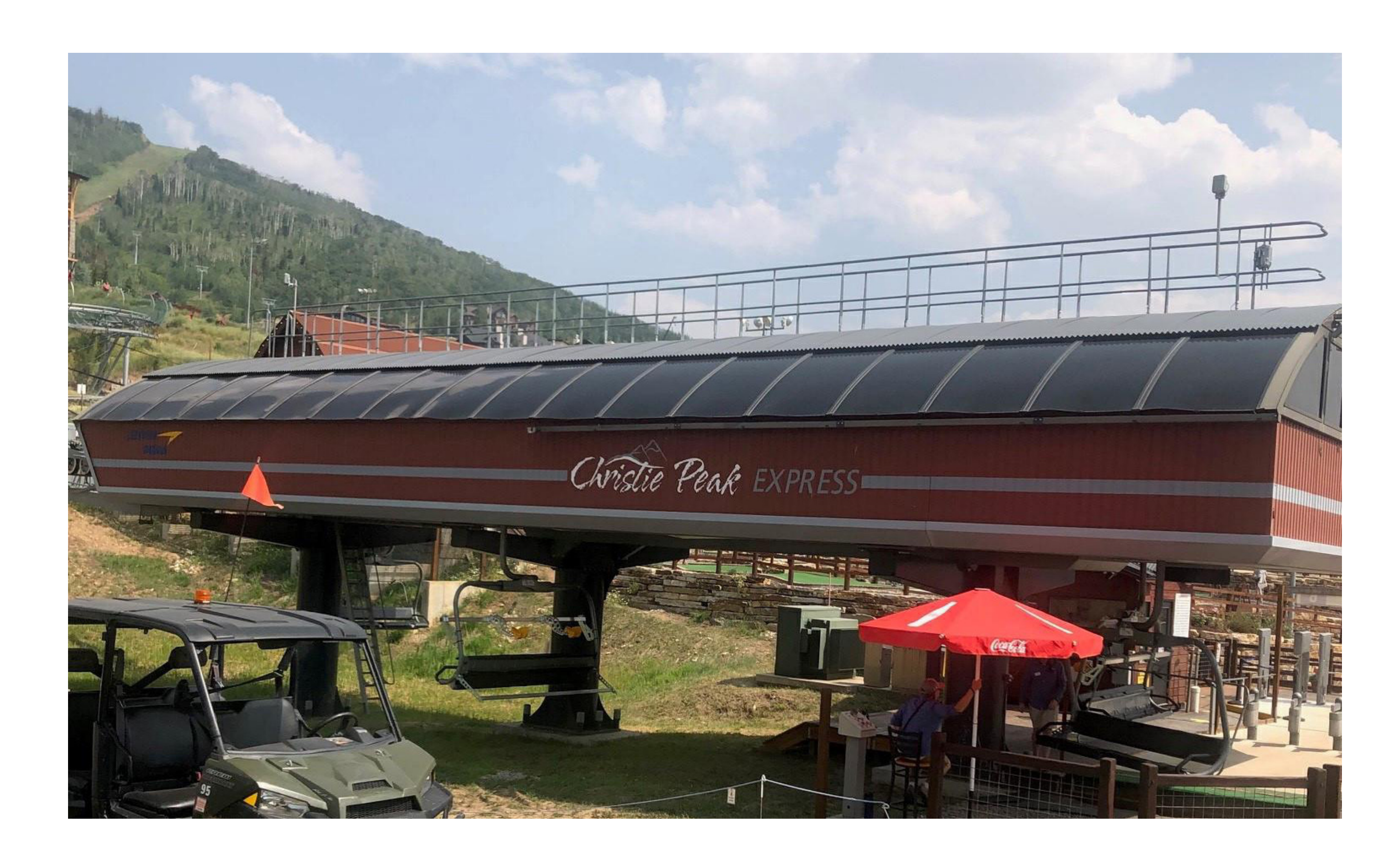
CPX LOWER TERMINAL - NORTH ELEVATION