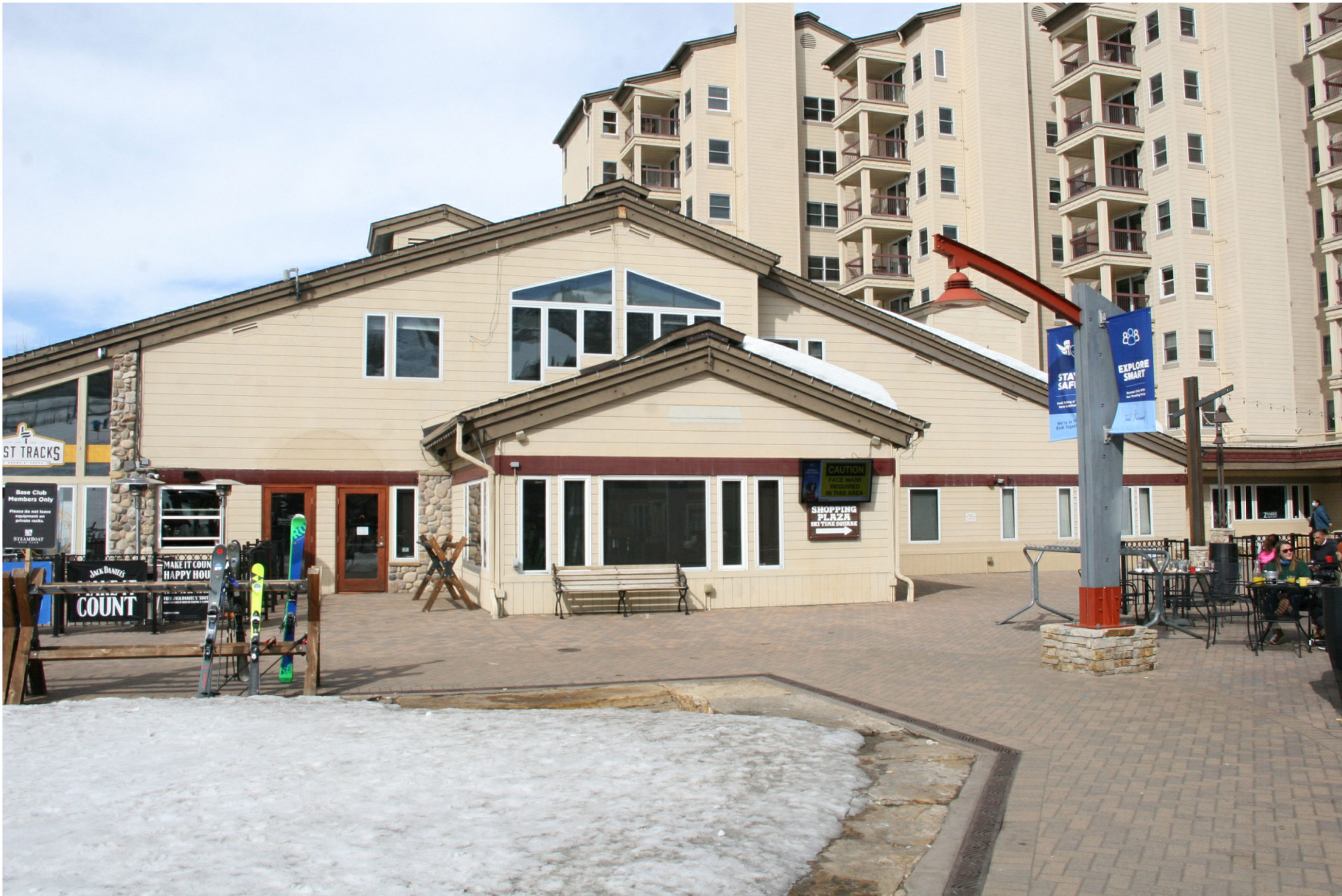
EXISTING COLORS FOR COMMERCIAL BUILDING C