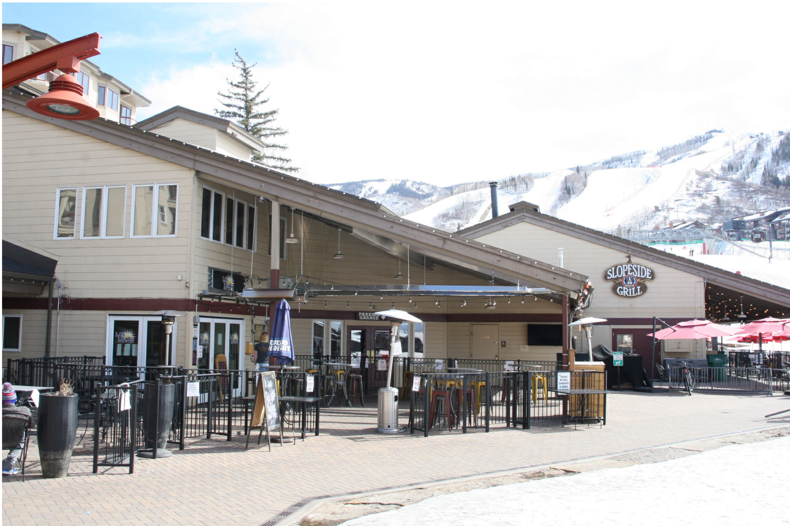
EXISTING COLORS FOR COMMERCIAL BUILDING D