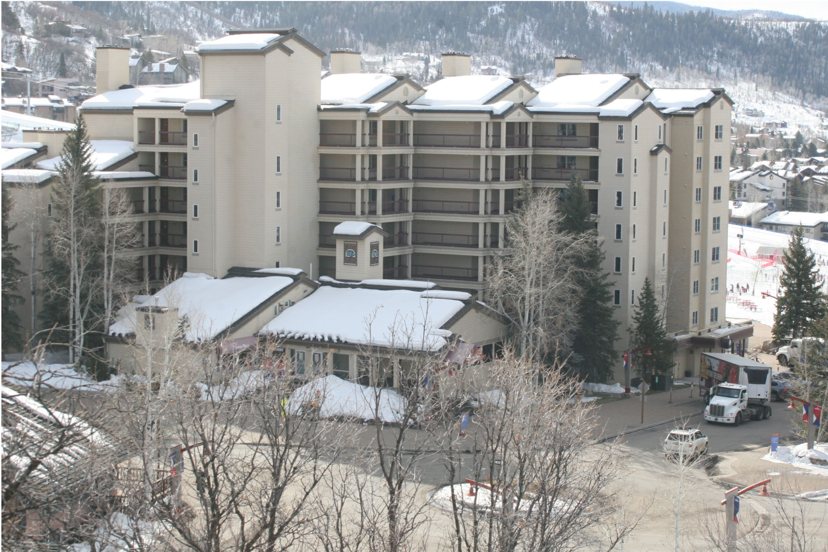
EXISTING COLORS FOR BUILDINGS A & B