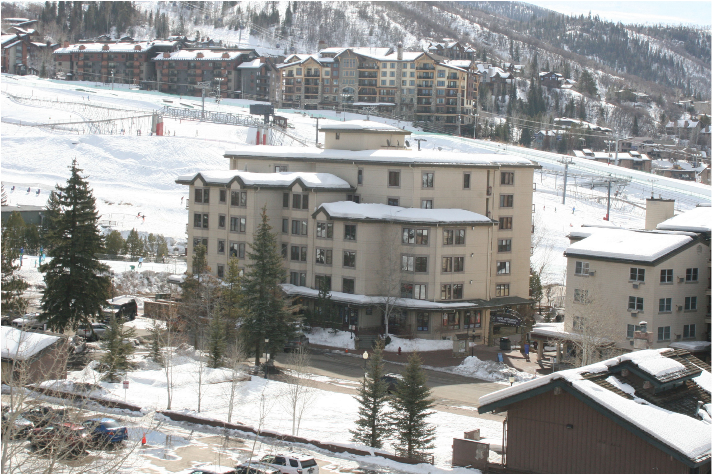
EXISTING COLORS FOR CREEKSIDE @ TORIAN - BUILDING E