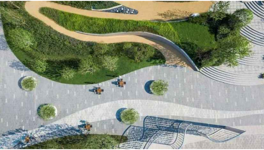
1.0 UNIT PAVING TYPE 1 & 2: PEDESTRIAN PAVING