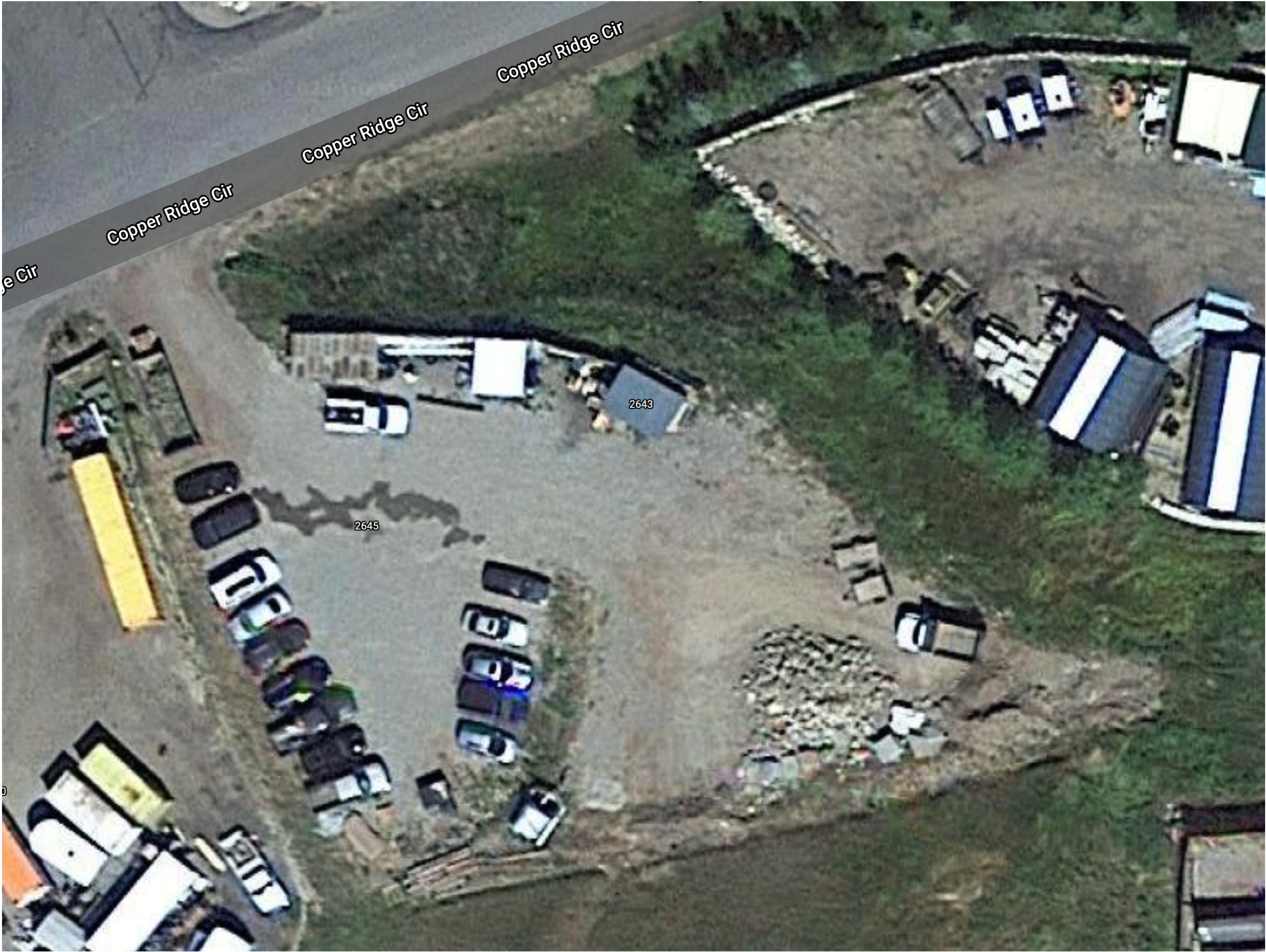
1 EXISTING CONDITIONS UNDER PREVIOUS OWNERSHIP-NOT TO SCALE

V:\Volumes\WorkshopL_Share\ERIK\life\--Cu RIDGE--\CuRidge\lot\PLANS\CuRidge2021SD.pln