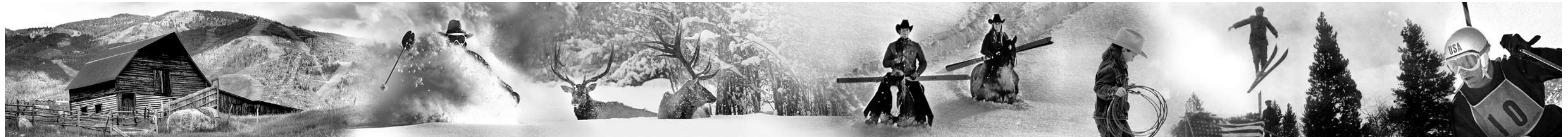
3 ORIGINAL IMAGE - BASIS FOR ART NTS