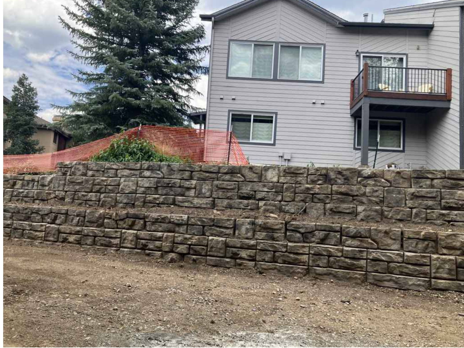
RETAINING WALL FROM PARKING LOT