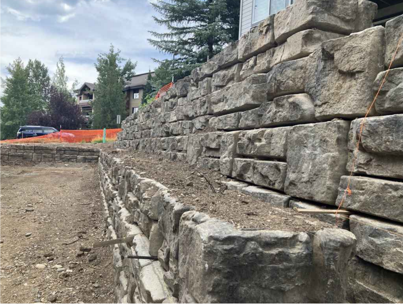
RETAINING WALL PLANTER AREA (Shrubs only)