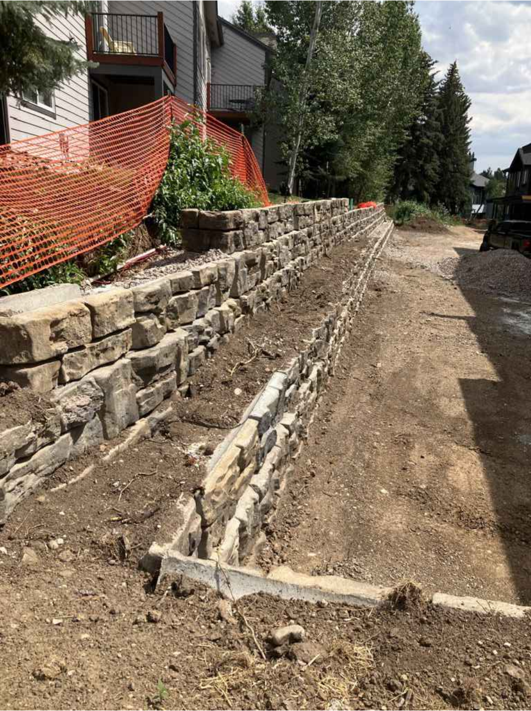
RETAINING WALL PLANTER AREA (Shrubs only)