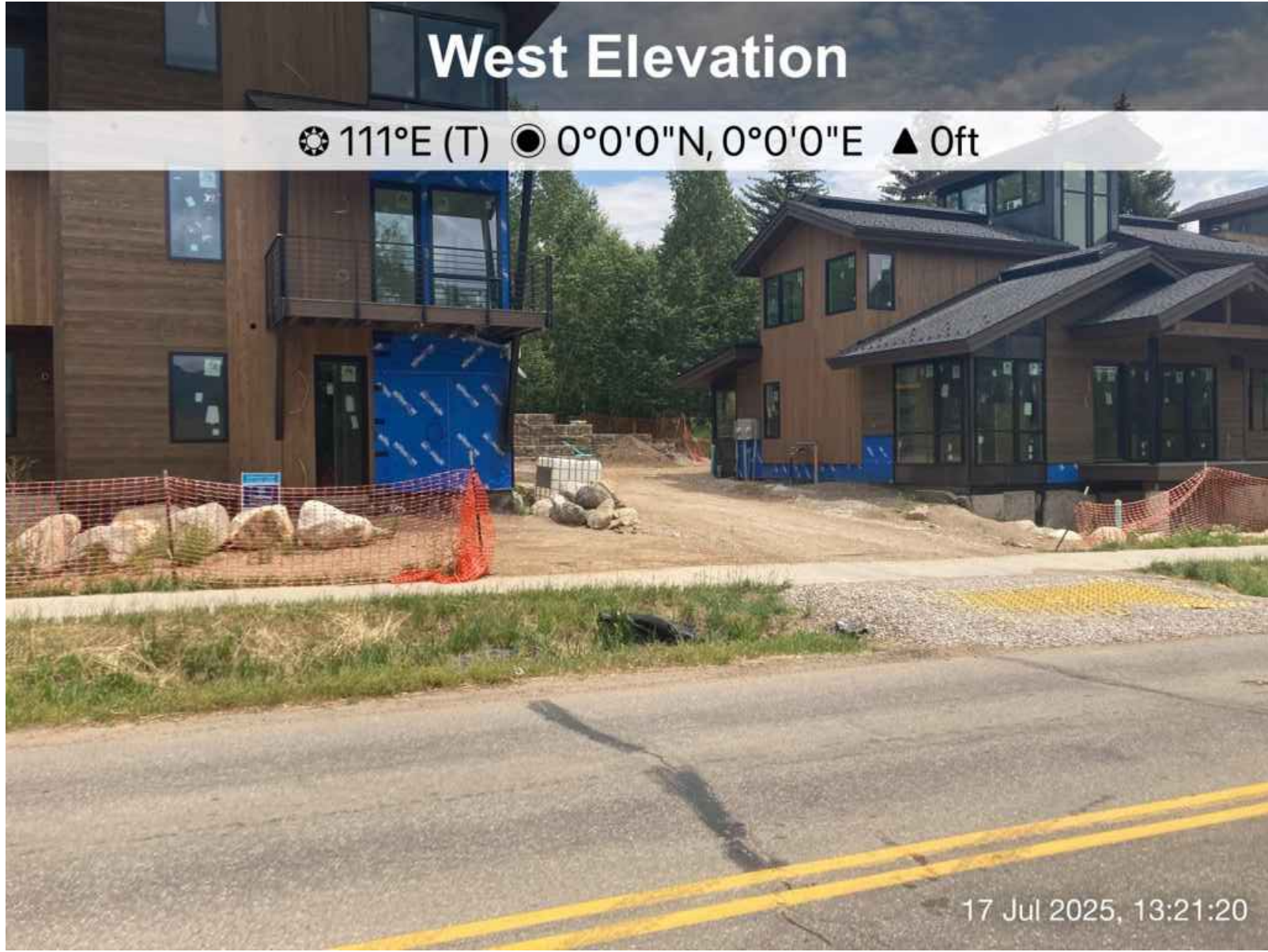
VIEW FROM PROJECT ENTRY