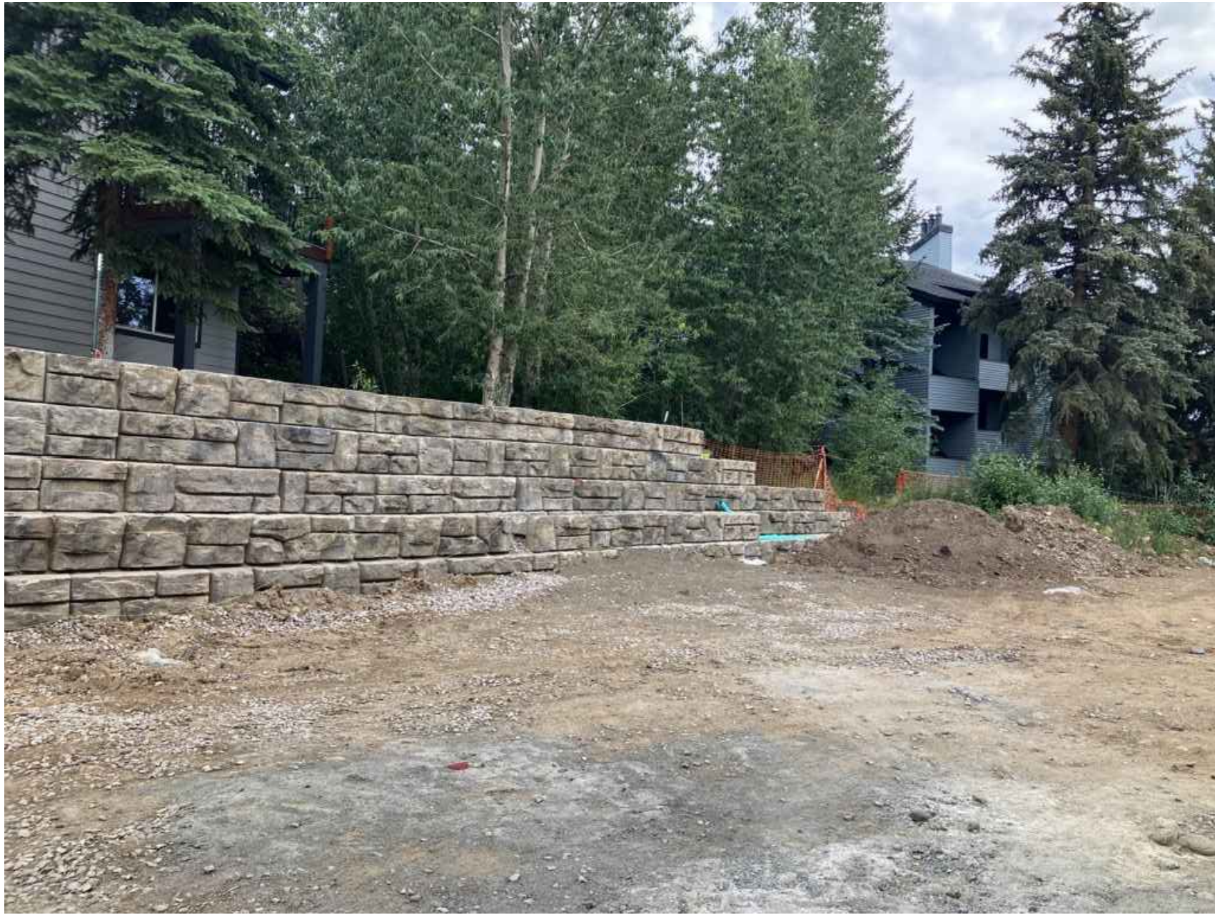
RETAINING WALL FROM PARKING LOT