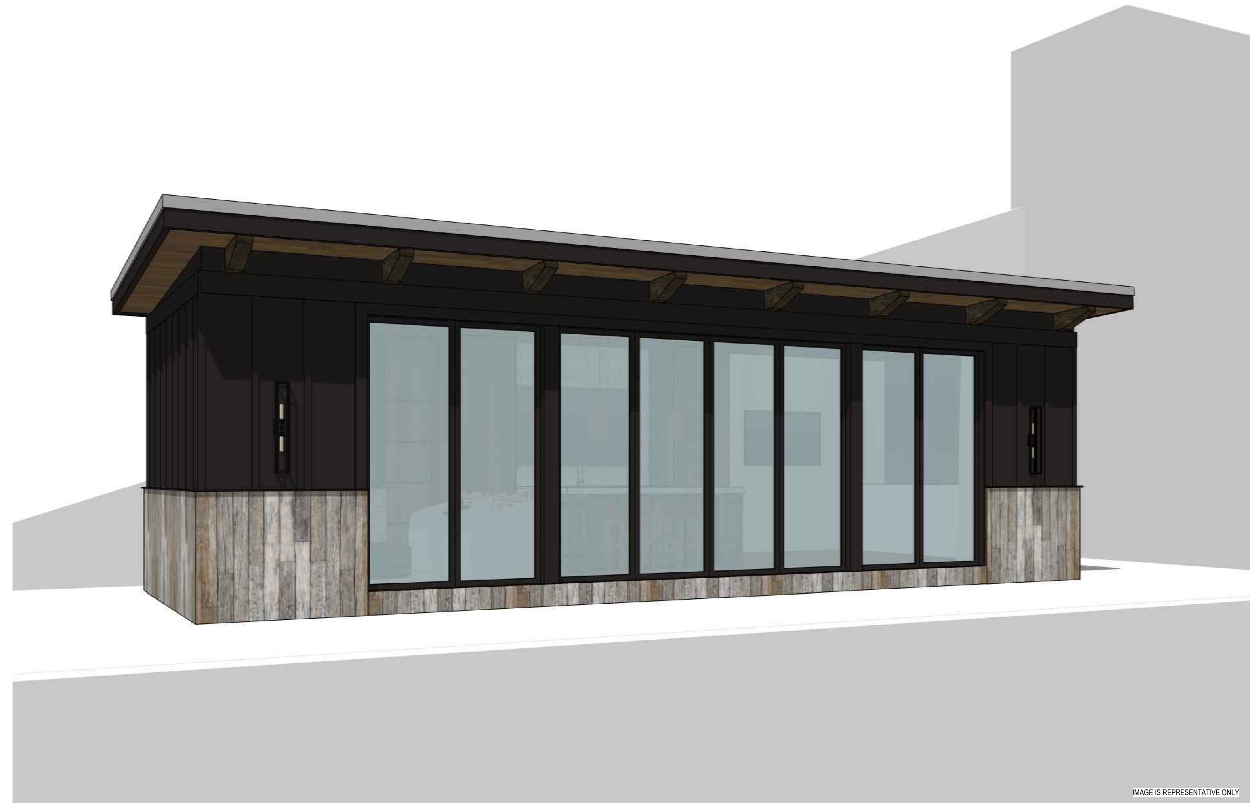
IMAGE IS REPRESENTATIVE ONLY