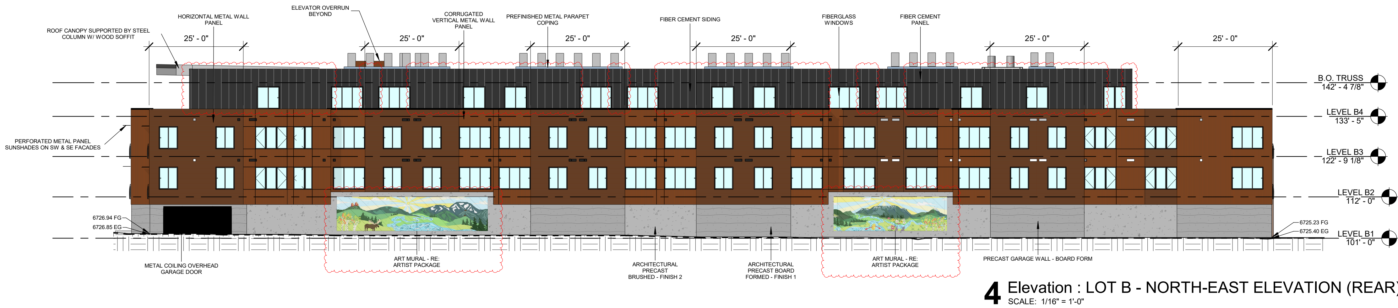
4 Elevation : LOT B - NORTH-EAST ELEVATION (REAR) SCALE: 1/16" = 1'-0"