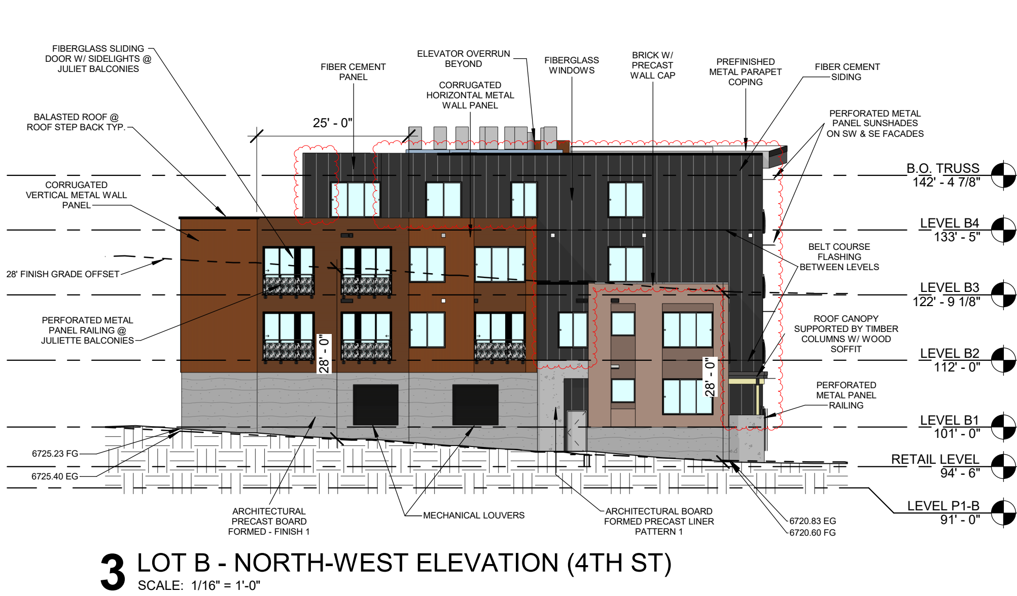
3 LOT B - NORTH-WEST ELEVATION (4TH ST) SCALE: 1/16" = 1'-0"