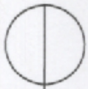
EXHIBIT 115 FLOOR PLAN 1