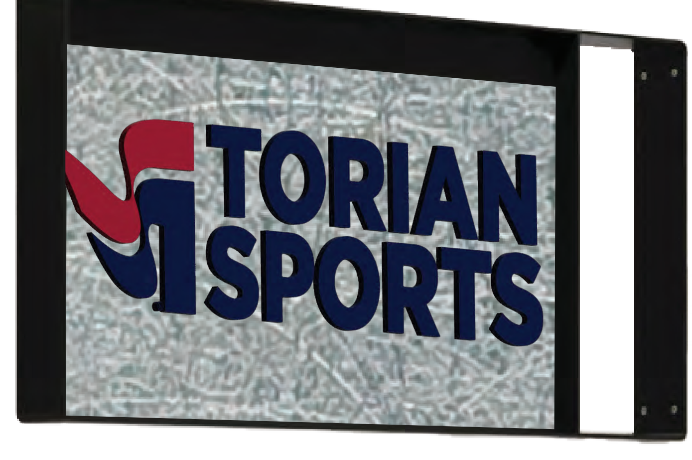
Side B - Recessed