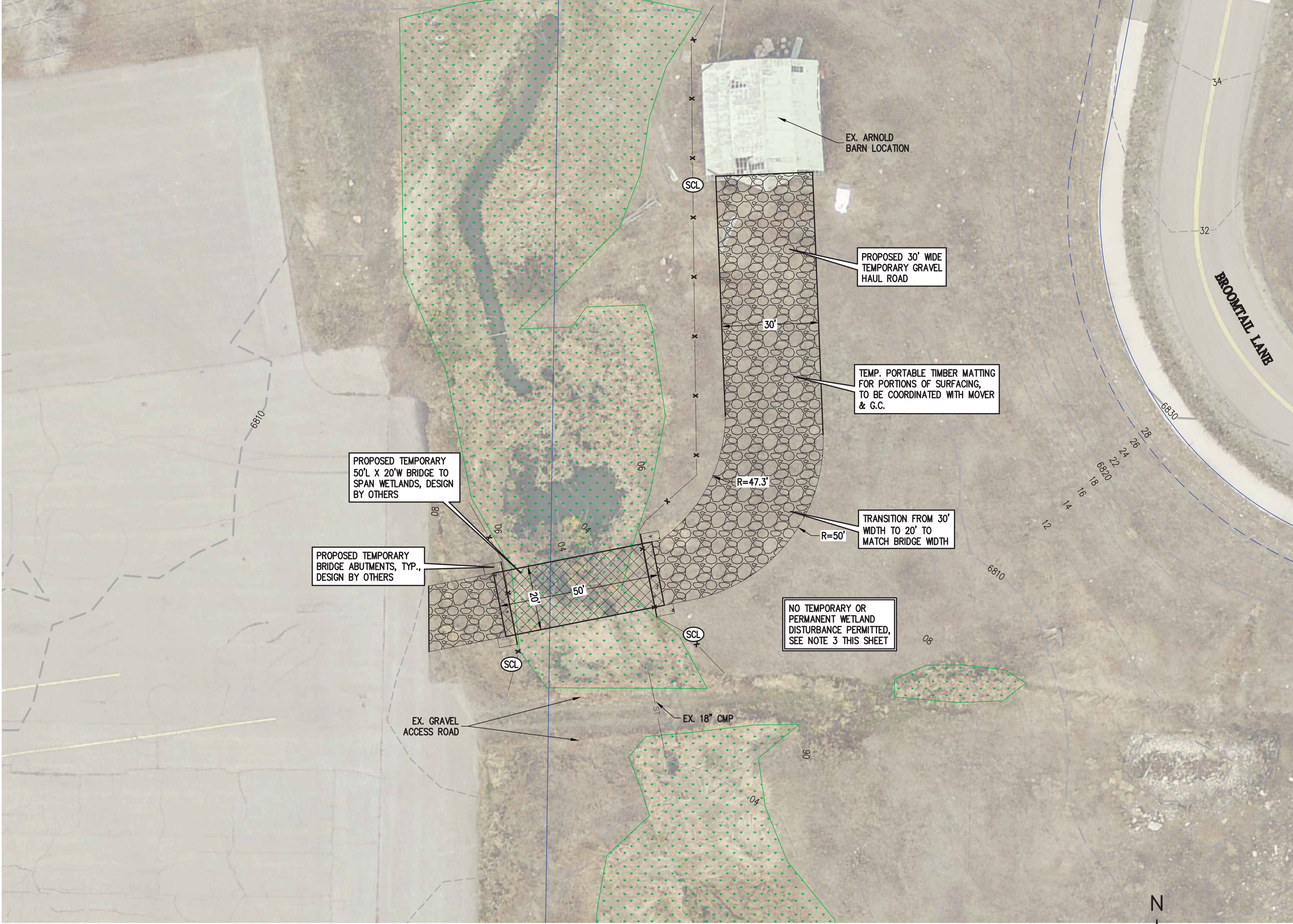
1 TH1 TH1 TEMPORARY HAUL ROAD FOR RELOCATING ARNOLD BARN

O:\C020169 Iconic Entry\Drawings\C020169 BARN ROUTE.dwg, 7/3/2018 3:43:37 PM, Chris Rundall