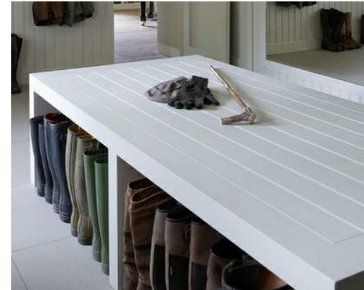
BENCH W/ SHOE STORAGE