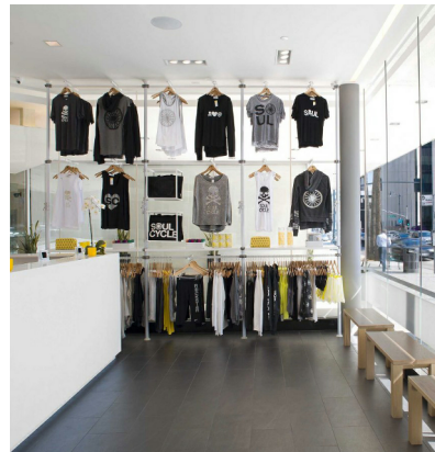
SHELVING + CLOTHES RACK