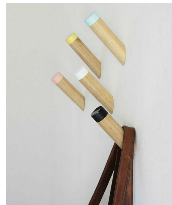
COAT HOOK WALL