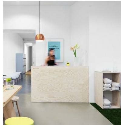
RECEPTION / COLOR CONCEPT