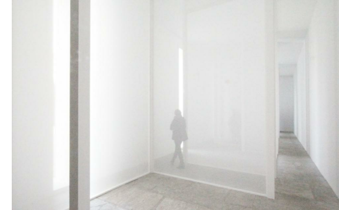
SCREEN CONCEPT- ROSEBRAND SCRIM