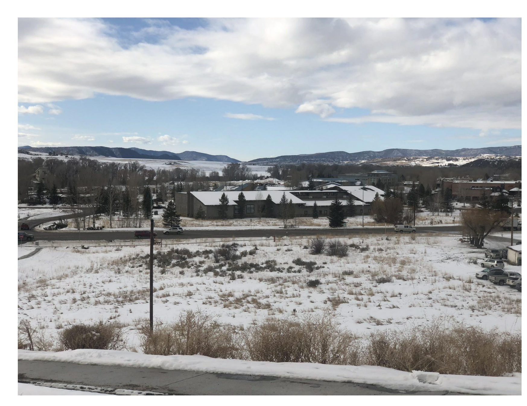
2 SITE PHOTOGRAPH G00001 N.T.S.