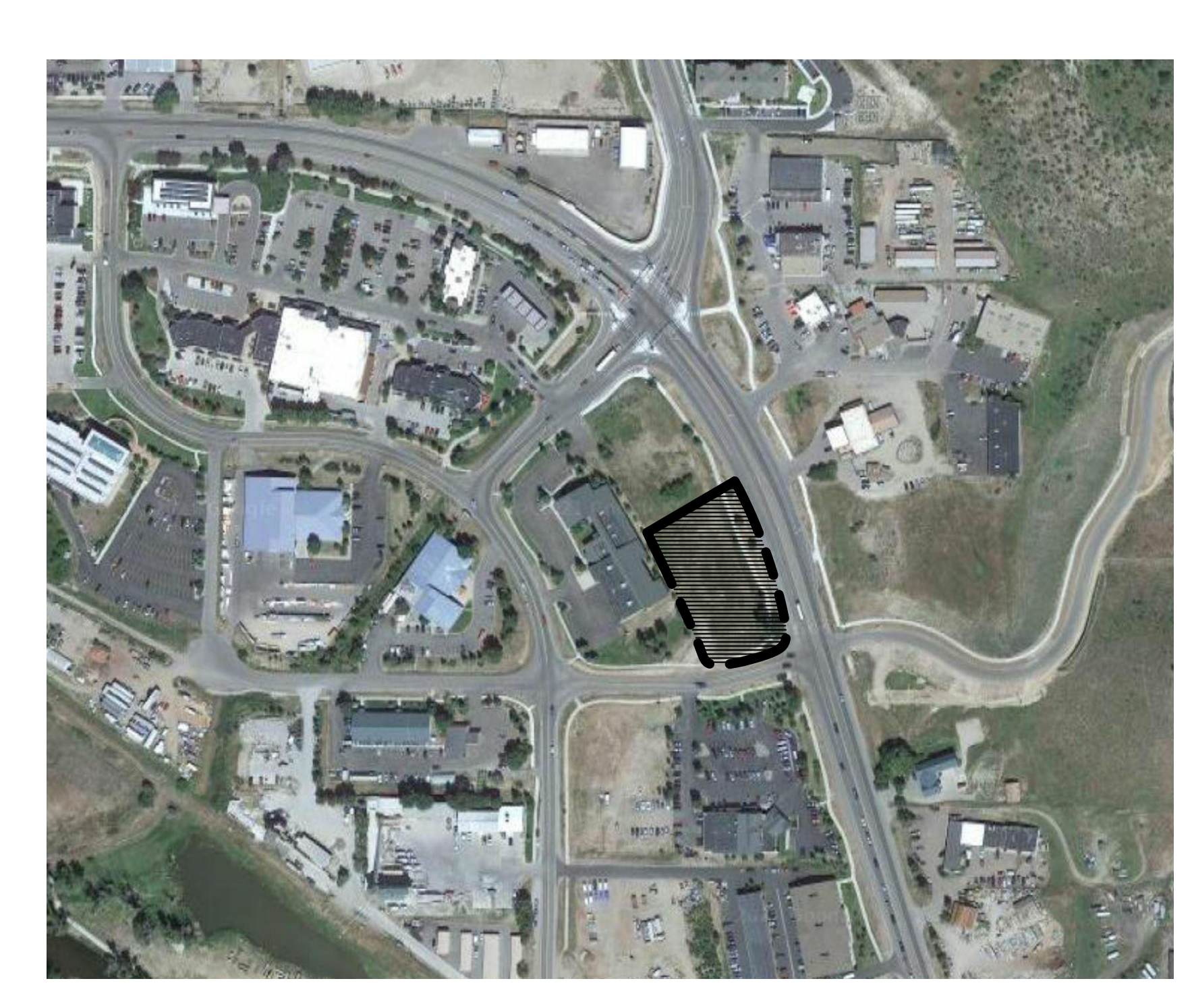
1 SITE LOCATION 80001 N.T.S.